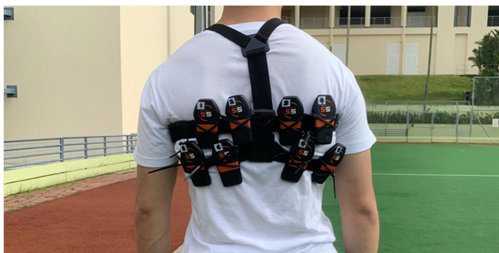
Figure 1. Each participant wore eight GNSS units at once in the maximal sprint test.

The Catapult S5 OptimEye GNSS system was used in the present study. Accessing GPS and Global Navigation Satellite System (GLONASS) satellite constellations, this GNSS system ensures high-quality data even in challenging performance environments ( https://www.catapultsports.com (accessed on 1 October 2020)). Eight 10-Hz GNSS units were worn at once on each participant during the test (Figure 1). The eight GNSS units were placed near the mid-back area using a custom-made strap, with slightly different positions. While the tightness of strap was adjusted to fit individual body sizes, the relative positions of the GNSS units on the strap remained consistent across all participants.